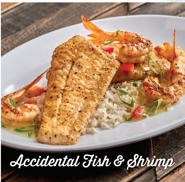
Accidental Fish & Shrimp

2,000 calories a day is used for general nutrition advice, but calorie needs vary. Additional nutritional information is available upon request.