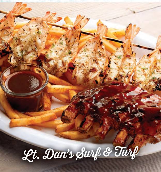
Lt. Dan's Surf & Turf

Baby Back Ribs, Grilled Shrimp, Fries. 1260 cals 25.99