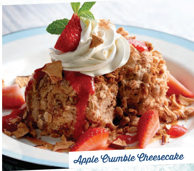
Apple Crumble Cheesecake

WE AIM TO PLEASE! WE FEEL THE SERVICE AND FOOD ARE SOMETHING TO BE PROUD OF AT BUBBA GUMP SHRIMP CO. AND IF EVER A PROBLEM - WE WILL FIX IT!