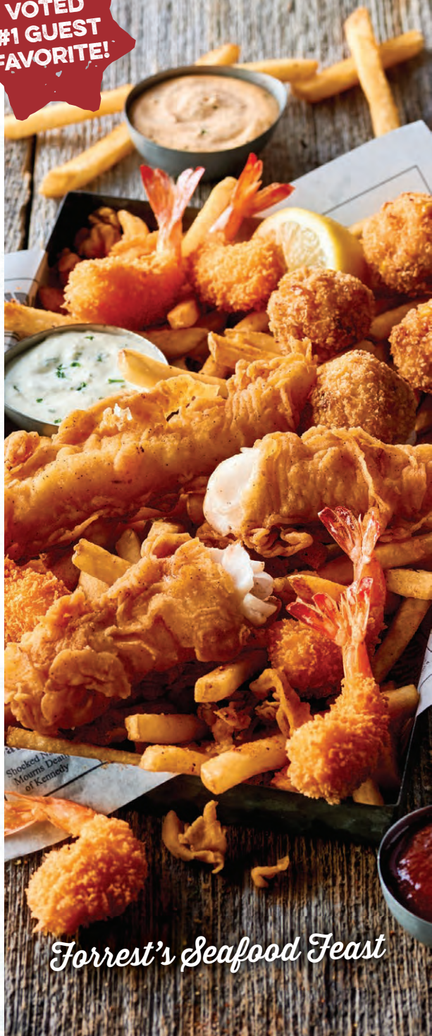
Forrest's Seafood Feast