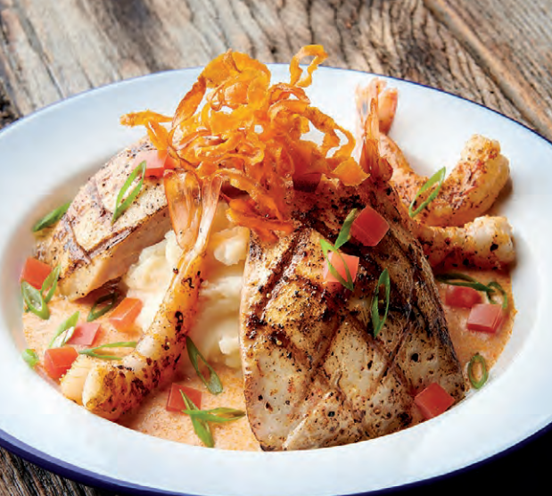
Bourbon Street Mahi Mahi