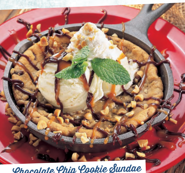
Chocolate Chip Cookie Sundae

Apple Crumble Cheesecake, Strawberry and Caramel Sauce, Whipped Cream, Strawberries. 860 cals 8.99