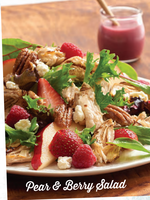
Pear & Berry Salad