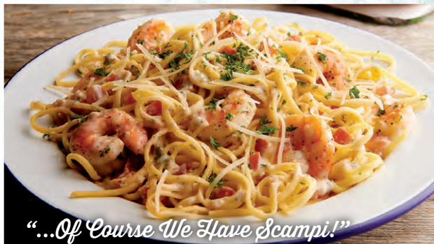
"...Of Course We Have Scampi!"