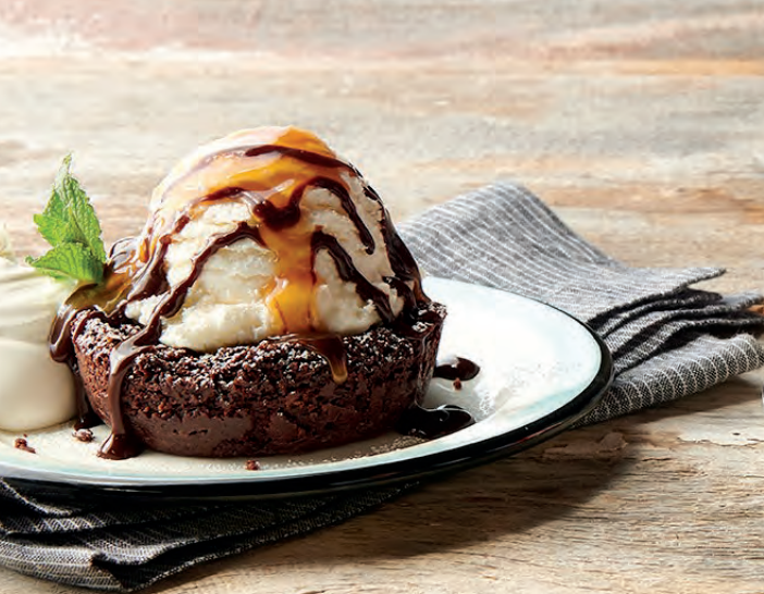
You had me at Chocolate