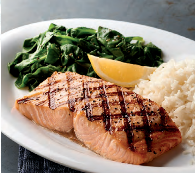
Maker's Mark Glazed Salmon