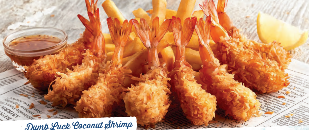
Dumb Luck Coconut Shrimp