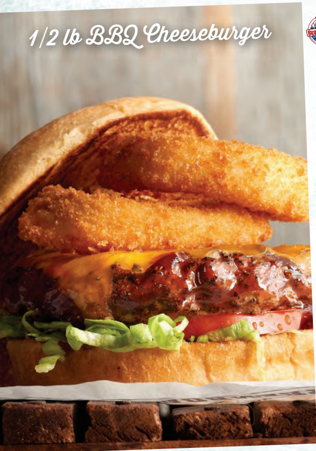
1/2 lb BBQ Cheeseburger

Three spicy Fish Tacos, Tomatillo Sauce, Slaw, Feta Cheese, Tortilla Chips. GS Upon Request Fried 850 cals; Grilled 730 cals 11.99 Substitute Fried Shrimp 1120 cals; Grilled Shrimp 790 cals 12.99